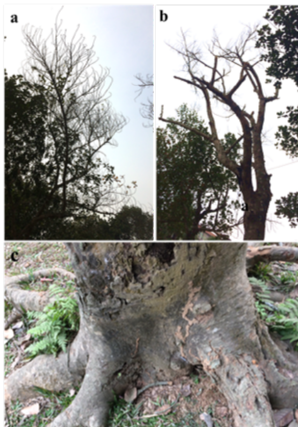
Figure 1. Symptoms of Jackfruit decline (a) partial die back observed in an infected plant, (b) complete death of infected plant, and (c) canker at the collar region and trunk of infected plant

tophthora spp. were identified based on their morphological characters described by Borines et al. (2013). The papillate lemon shaped sporangia (Fig. 2) developed in both soil bait (rose petal) and onion agar are the major morphological characteristics of isolates. All the isolates were showing similar characteristics. Therefore, they were named as Phytophthora spp. All three isolates of Phytophthora spp. infected