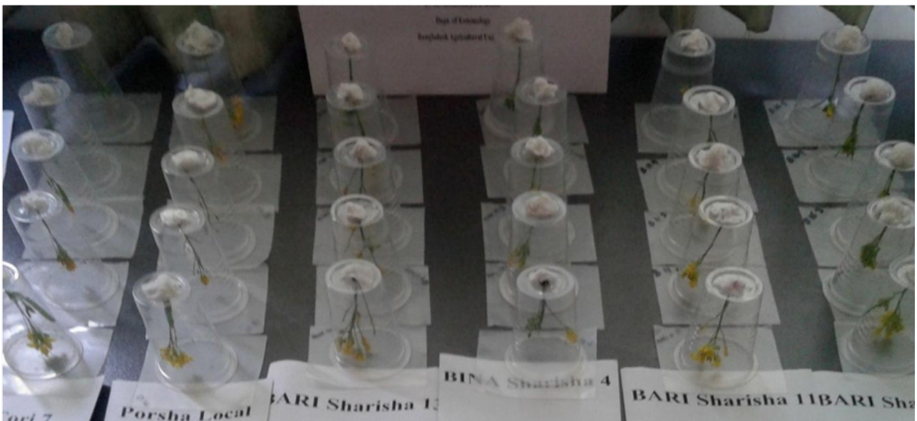
Plate 2. Feeding chamber of aphids with different mustard varieties at water stress condition