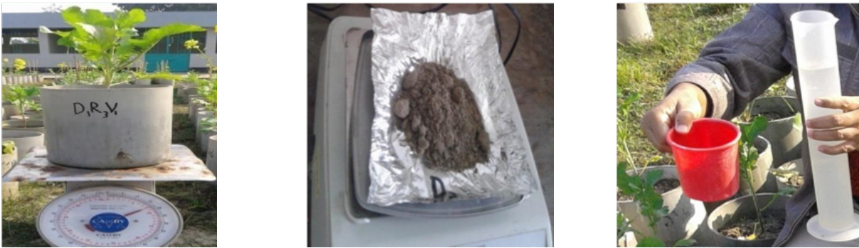
Plate 1. Maintenance of water stress treatments by continuous weighing and watering