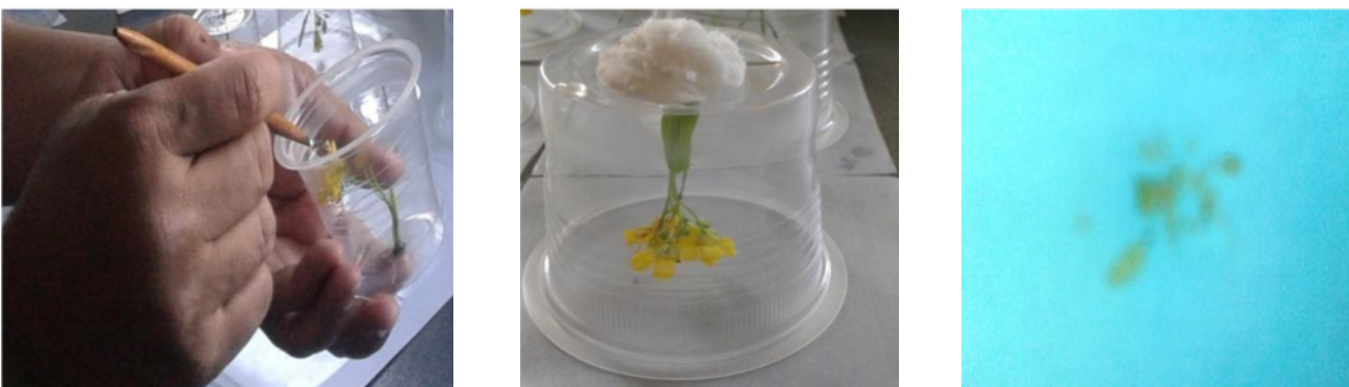
Plate 3. Artificial aphid infestation to the mustard inflorescence (left), Placement of feeding chamber on Para film paper (middle), and Honeydew secretion by aphid on Para film paper (right)