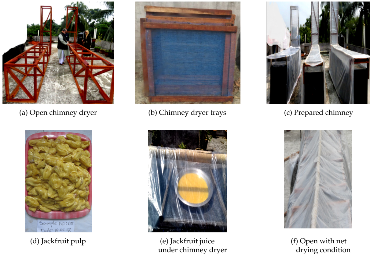
Figure 1. Different steps of drying jackfruit juice under UC Davis chimney dryer and open with net drying condition

maximum 11.25 d for V1 whereas minimum required time to dry was 9.75 d for V2 (Table 1). Moisture content was higher (85.39%) for V2 than that of V1 (85.11%). Dry matter content was higher (14.89%) for V1 whereas lower dry matter content was recorded (14.62%) for V2. Initial TSS was higher (21.58%) for V1 and lower (20.25%) for V2 variety. Final TSS was higher (21.58%) for V1 and lower (20.25%) for V2. Relative humidity was higher (53.35%) for V1 whereas lower relative humidity (%) was 52.96% for V2. Storage times were higher (143.08 d) for V1 whereas lower storage time was (129.08 d) for V2 varieties.