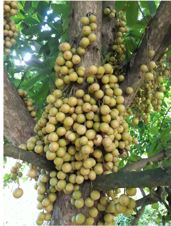
Figure 1. A Burmese grape ( Baccaurea ramiflora Lour.) tree with fruits

The study was conducted at the Piruzali village of Gazipur district during March to September 2018. The study was located at the center of Madhupur Tract at 8.5 m above sea level. The site was previously under Sal forest and developed for residential area.