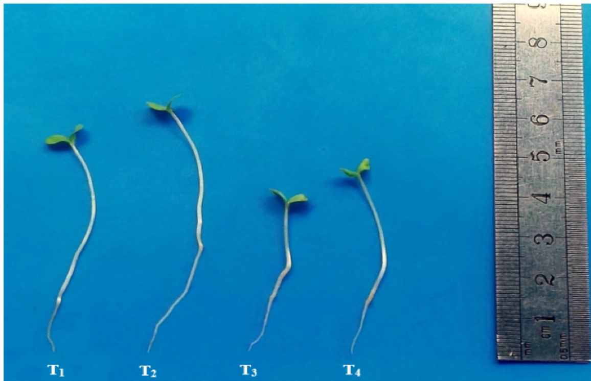
Figure 2. Effect of growing season on seedling growth at day 5 after germination (T1 = On-season Deshi jute seeds, T2 = Off-season Deshi jute seeds, T3 = On-season Tossa jute seeds, and T4 = Off-season Tossa jute seeds)