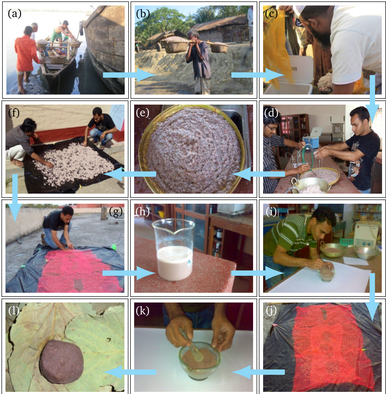
Figure 1. Different steps of improved method of Nga-pi preparation. (a) Raw materials (shrimp) in boat, (b) Carrying to the ghat, (c) Fresh shrimp in insulated box, (d) Washing and storing, (e) Dewatering, (f) Sun drying, (g) Fish covered with net, (h) Mixing salt, (i) Grinding, (j) Sun drying, (k) Grinding, (l) Nga-pi covered with Mospata and kept for aging